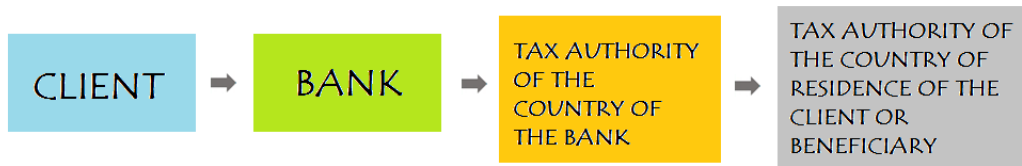
Figure 3 - Bank Place in the process of exchange of information

The exchange of information will take place between the competent authorities of the member countries of MCAA (received by them from the "accountable financial institutions" in their countries) each year on an automatic basis in a standardized electronic format.