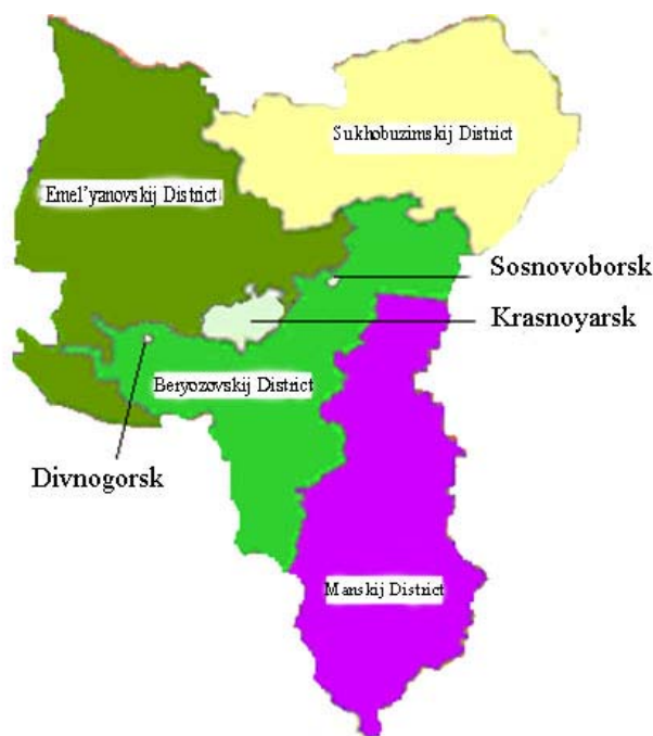
Fig. 1. Krasnoyarsk Agglomeration

and parasitic diseases and car accidents. Ecology is also influential and causes more and more deaths of neoplasm.