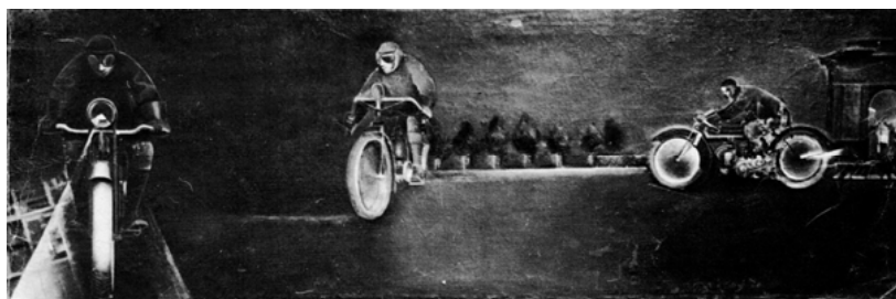
Fig. 3. K. Vyalov. "Motorcycle Run". 1925

and alternation of elements to strengthen the dynamics of the perspective line.