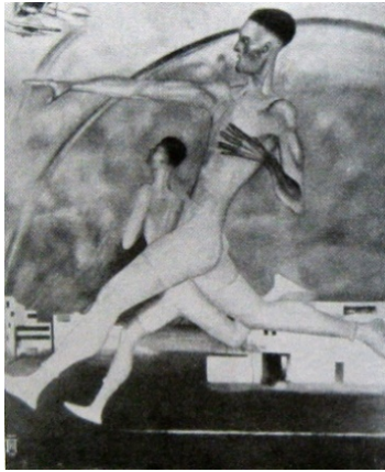
Fig. 2. Yu. Pimenov. "Run". 1928

to the figures. The appeal to graphic means of the German expressionism for which the OST had been blamed more than once, in this case corresponds to the subject. We consider laconicism, the raised effusiveness, hyperboles, impetuosity and even a physiologism to be the best artistic techniques to transmit of the atmosphere of physicality, precipitancy of the movement.