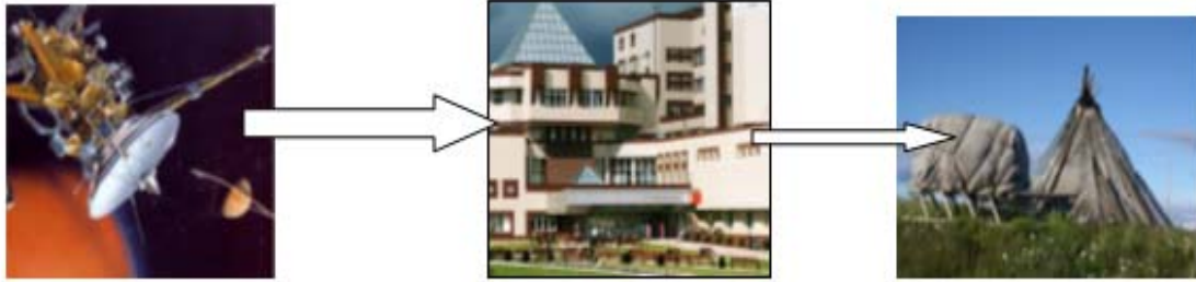
Fig. 2. A good example of adapting technology to the civilian defense industry market.