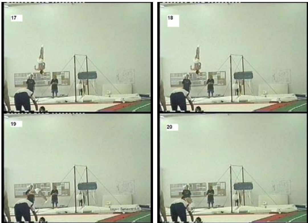
Fig. 2. Performance of the dismount double salto backward straight with 2/1 twist on the horizontal bar.