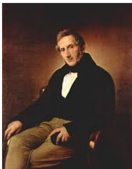
Alessandro Manzoni (1785-1873)