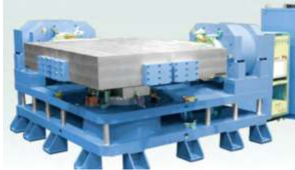
Figure 1. General view of SHINKEN vibration test system

A general view of the Series G6 three-axis vibration test system is shown in Figure 1.