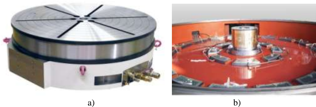
Figure 4. ZOLLERN Hydrostatic Turntable on Hydrostatic Bearings

Hydrostatic supports in precision measuring equipment. ZOLLERN produces rotary tables (Figure 4, a) on hydrostatic bearings (Figure 4, b) up to 550 mm 11 in diameter for measuring machines that measure deviations in the geometric parameters of large parts. The 1000 mm diameter turntable is capable of receiving an axial load of up to 120 kN and providing an axial run-out of less than 1 μm.