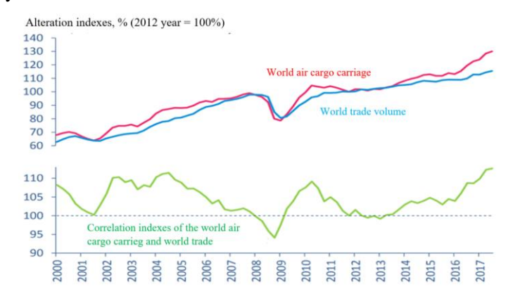
Figure 2. Comparison of indicators in the world trade changes of air cargo carriage (based on IATA).

According to the International Air Transport Association (IATA), over the past five years, the volume of cargo has increased from 48 to 62 billion ton-kilometers, i.e. by 29%. At the same time, the growth rate in recent years has increased markedly, only from April 2016 to October 2017 the studied indicator increased by 21%.