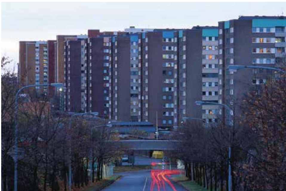
Fig. 2. The Million Homes Programme housing blocks, Stockholm, Akalla, 1998 (The Million Homes Programme, Stockholmskällan, 2020)