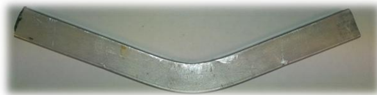
Figure 3- Sample of waveguide with a bend angle of 120°