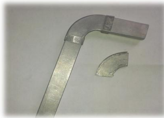
Figure 4- Prefabricated variant №1

In the laboratory of Department of Metal Forming two prefabricated variants were developed (Fig. 4 and Figure 5):