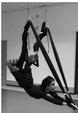
Fig. 1. Layback

Some exercises of Anti Gravity fitness are presented in figures below: