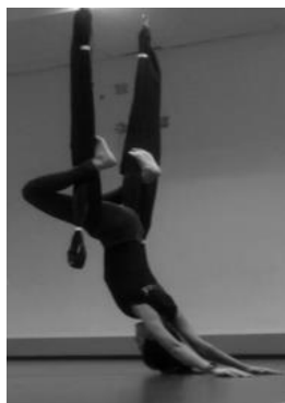
Fig. 2. Bent forward