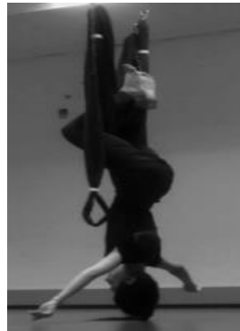
Fig. 3. Decompression fall over