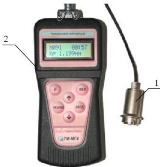
Figure 1. General view of the thickness gauge.

For further research, a coating thickness gauge of the TM-20MG4 model was used (figure 1), which includes an induction transducer 1 and an electronic unit 2.