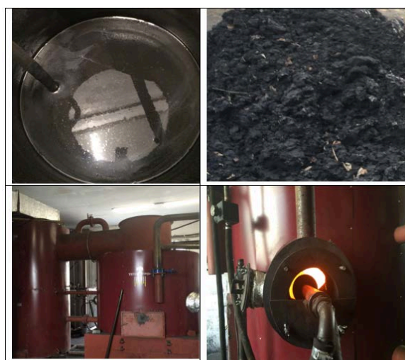
Fig. 3. WCS from the filter cake and the burning process of the fuel.

Figure 3 shows the WCS from the filter cake, the appearance of the heat generator and the burning process of the fuel.