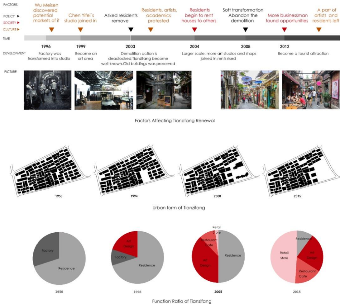
Figure 2. Tian Zi Fang changes

Years ago, 52% of the shops were of art and design, with 25% for dining and a mere 7% of retailing. Nowadays, the retailing has come up to 51% and 17% for dining and only 29% of art. The percentage of rented ground floor has reached over 90% from the absolute zero in 2004. The district largest population proportion is made up of merchants and tourists (Zukin, 2016)