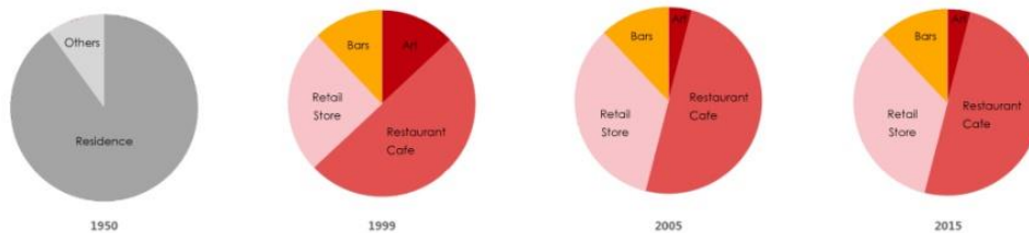
Function Ratio of Xintiandi