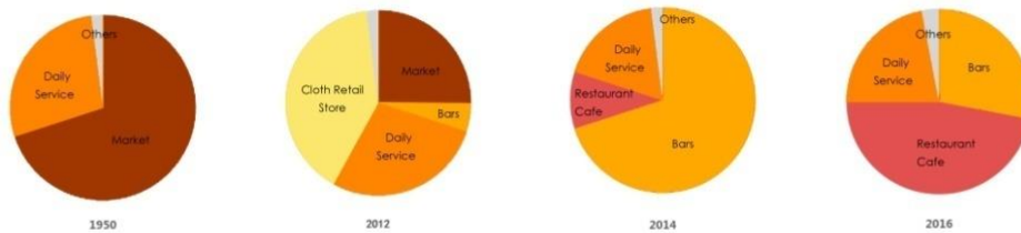
Function Ratio of Yongkang Road