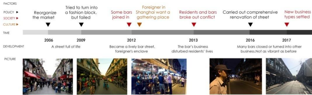
Factors Affecting Yongkang Road Renewal