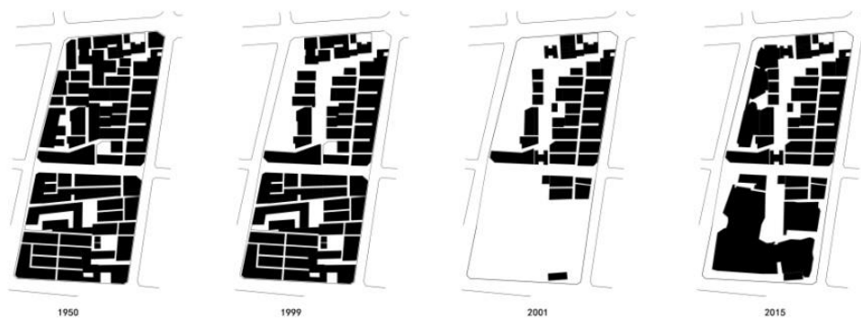
Urban form of Xintiandi