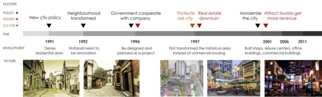
Factors Affecting Xintiandi Renewal

Xin Tian Di is located in the center of Shanghai city and represents a part of the old city reconstruction project in the Taipingqiao area of Luwan District. In the 90s of the last century, it used to be the old-style Shikumen Lane, a densely populated area. As it is impossible to meet the needs of the city's commercial development in the central district of Shanghai, the government decided to reconstruct this area and transform it into a dynamic district by not only providing fashionable business activities, but also a well-made living environment. They also requested that the project must be coordinated with the metropolitan structure of Shanghai city.