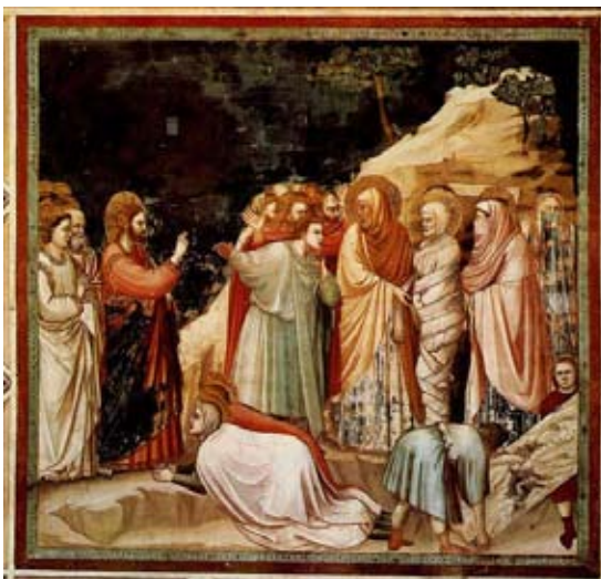
Giotto. The Raising of Lazarus

О, Царь и Бог мой! Слово силы Во время оно Ты сказал, -