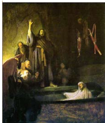
Tintoretto. Resurrection of Lazarus