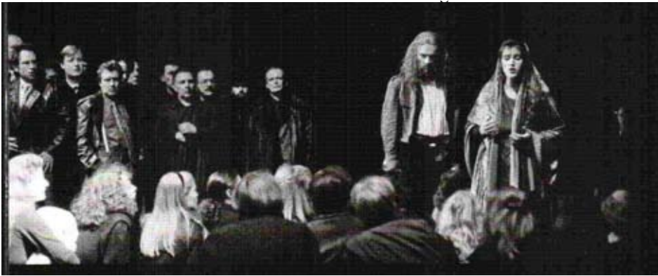
At the premiere of the cantata by A. Corgi

Никому нет спасения и никому нет погибели.