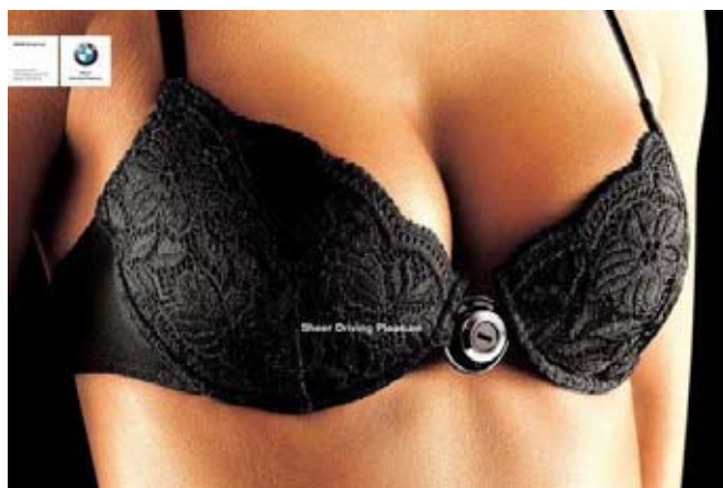
Fig. 6. BMW cars advertisement

constrain development of not only women but also men. It is noteworthy that modern researches don't only study certain stereotypes, but also develop a kind of "portraits" of modern men and women. Thus, for example, D. Buchan's point of view became very popular: men were considered "active" (doing something, solving problems, aggressive), and women – "communicative" (passive, emotional, interested not in business but in relationships between individuals). [3].