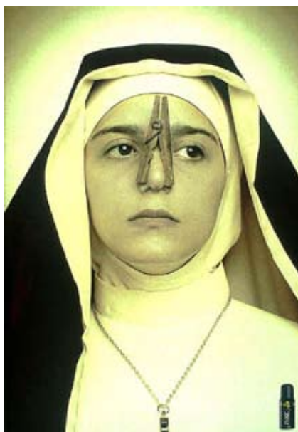
Fig. 5. «AXE» deodorant advertisement