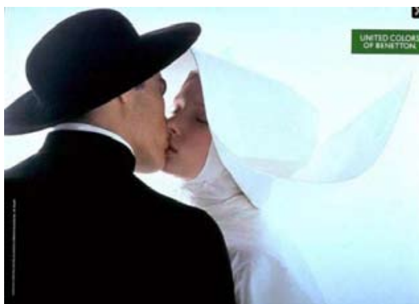
Fig. 3. Advertisement of "Benetton"

Gender stereotypes imply descriptive qualities and characteristics of men and women and contain normative behavior patterns of each