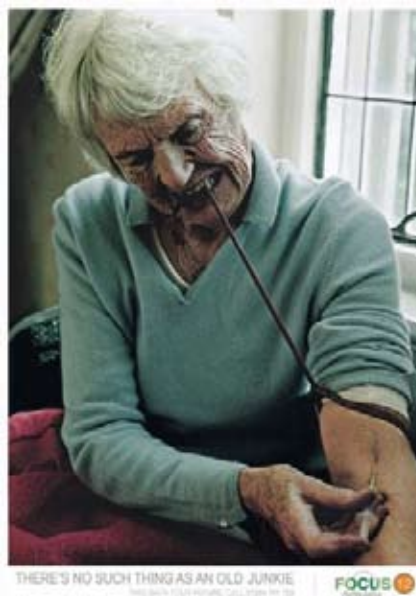
Fig. 7. Drug addiction treatment centers advertisement