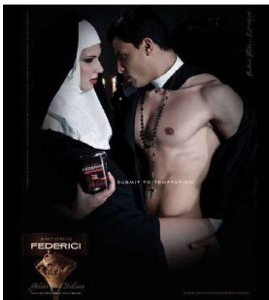
Fig. 4. Coffee advertisement with religious images