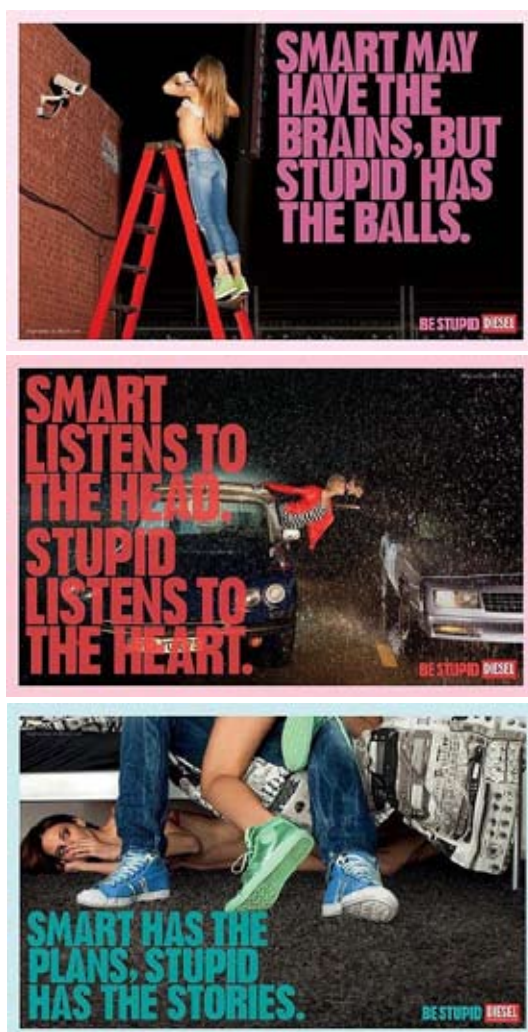
Fig. 8. «Diesel» clothing advertisement

As consequences of generalization, gender stereotypes form our expectations concerning men's and women's behavior. Using such an approach advertisement should not only effectively use these expectations of its audience, but also, if it is necessary, form new expectations. Consequently, advertisement that does not confirm the stereotype, but denies it becomes the most interesting. Such advertisement becomes the most original, and at that the use of stereotypes can be regarded as an essential tool in creating a promotional product.