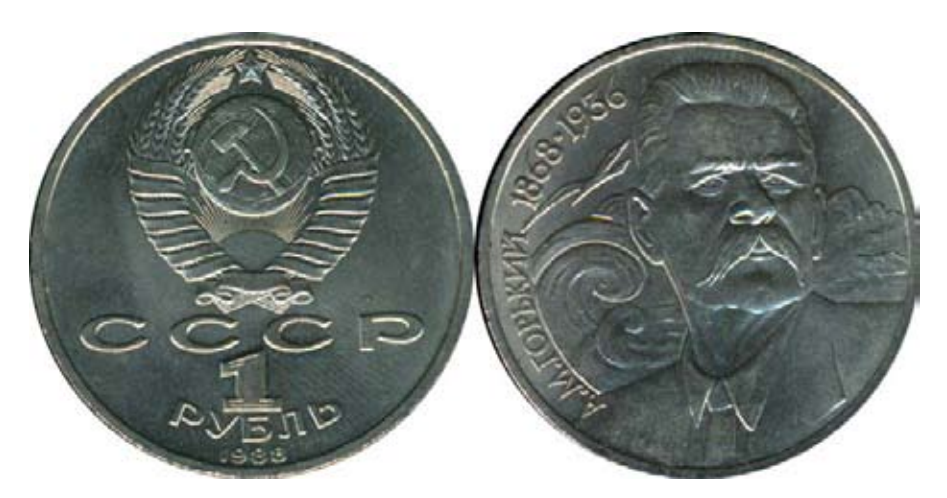
Stormy petrel and the stormy ocean on the USSR 1 ruble coin. We can not understand the petrel coulor.