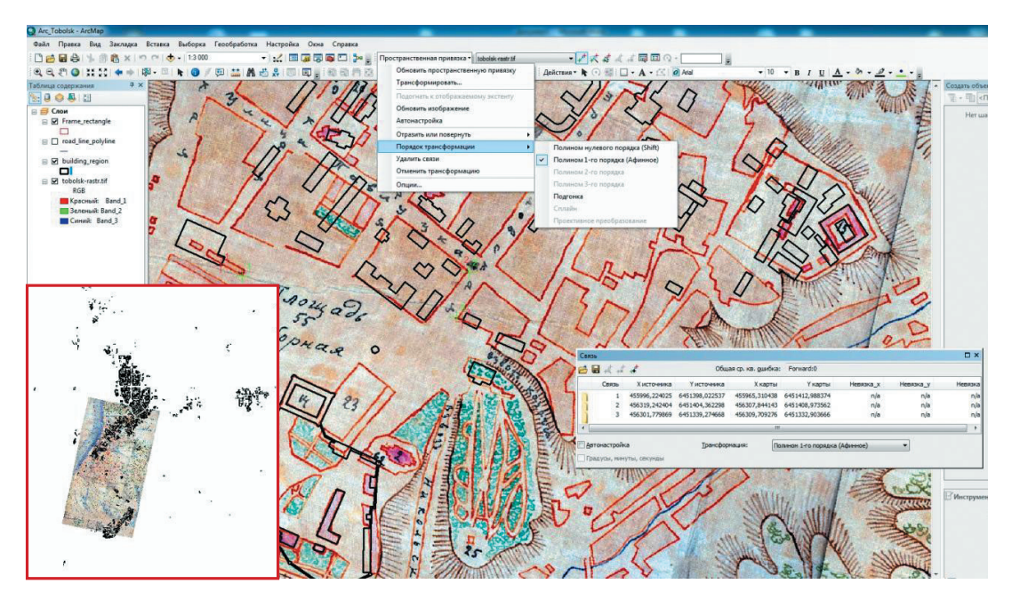
Fig. 1. Georeferencing and raster transformation (map of 1860) using fiducial points and vector layers in ArcGIS. Note: black contours are a vector layer of modern buildings, red contours are buildings on the 19<sup>th</sup> century map

A detailed description of the "rubber sheet" algorithm for solving similar problems was applied by a group of researchers including A.A. Frolov, A.A. Golubinsky and S.S. Kutakov (2017). Working with the drawings of Moscovia, which were made