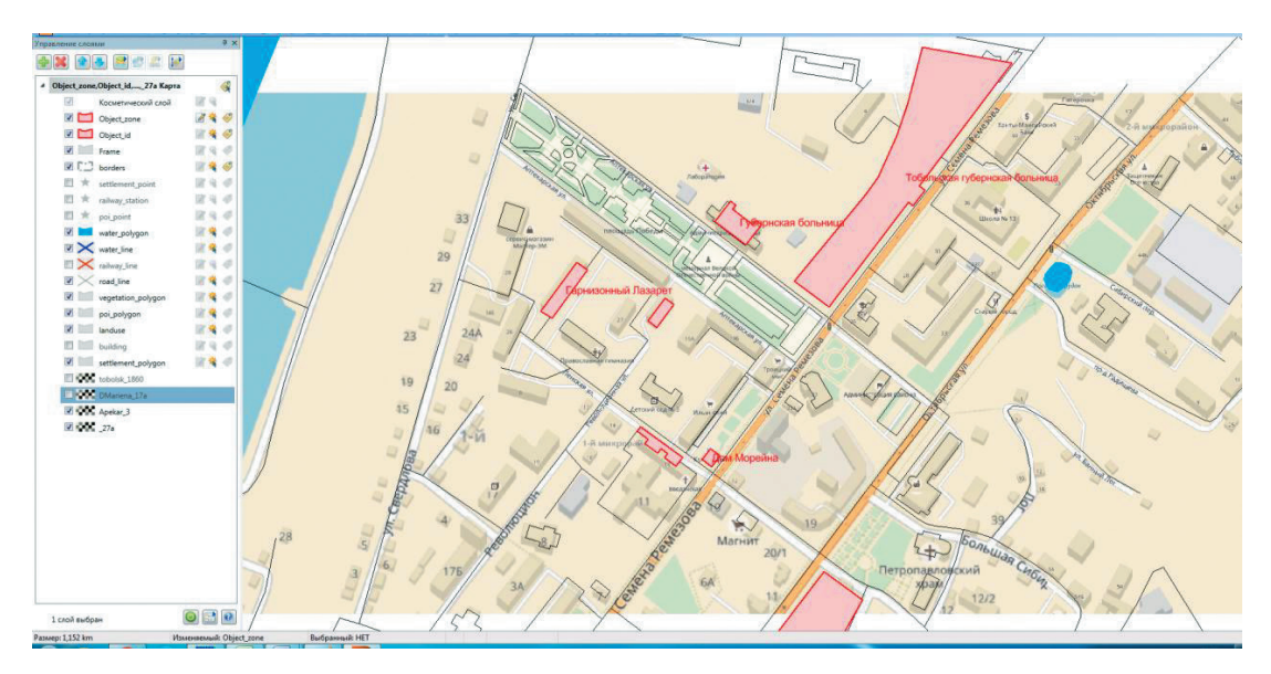
Fig. 2. Digitization of layers based on georeferenced substrate

ambiguous. For instance, the plan used for Tobolsk is not at all a prototype in terms of its representation, style, design, correctness and clarity of lines, etc. Meanwhile, the city buildings and blocks displayed in the plan are planimetrically accurate and largely observe the proportions, shapes and sizes of objects.