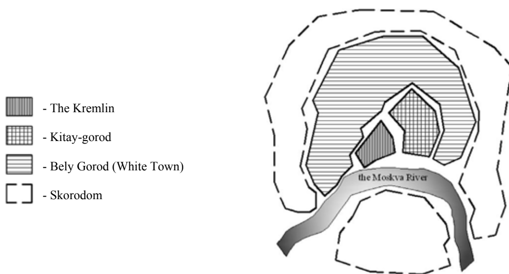
Fig. 1. Main areas forming Moscow historic centre

The problems of discovery, preservation and display of an architectural-and-archaeological heritage of any historic city are always complicated. For Moscow this complexity increases manifold. It is not due to the fact that the capital of Russia is a modern city where an intensive urbanization process leaves its marks on a historic environment condition (nowadays it is typical to many large cities of our country and abroad). The duration of Moscow's existence can't be regarded an obstacle for architectural archaeology development either as other cities went through not shorter (and very often even much longer) historic ways. According to modern view, almost millennial existence of the historic settlement called "Moscow" makes it possible to rate the city among "young" European capitals. There are two reasons that make Moscow different from other historic settlements. The first one is that a historic centre of the city formed during feudalism period has remained unchanged with a surprising steadiness for many centuries (Fig. 1).