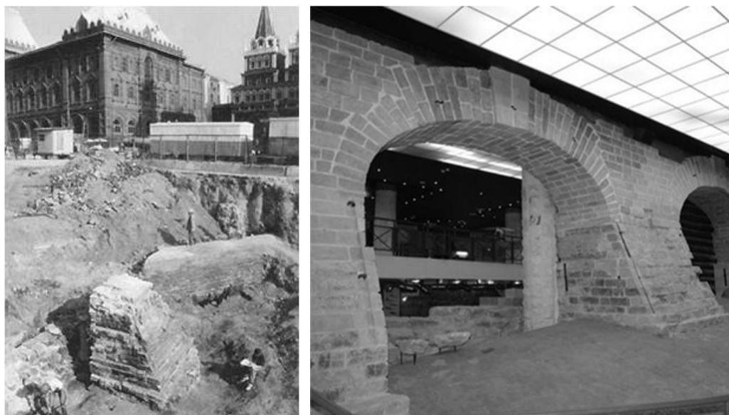
Fig. 3. Moscow. Voskresenskiy (Kuryatniy) Bridge, XVI-XVII centuries on the left: excavations of the bridge in Manezhnaya square, 2004 on the right: bridge abutments, displayed in the Moscow Archaeology Museum, present day condition

excavation sites must be foreseen in every zone. Display of Voskresenskiy Bridge fragments, a monument to the architecture of the XVI – XVII centuries, on the excavation site in 1997 can be regarded as one of the initial stages of such work (Fig. 3). The monument is exhibited at the depth of 7 meters, in the premises of the Moscow Archaeology Museum at present. Ruins reconstruction is differently regarded by the specialists for the reason that real remains of the bridge are difficult to distinguish from the “antique” imitation. Modern brickwork is applied to its reconstruction; the interior includes marble columns which close authentic parts of the ancient bridge abutments. This finally deludes many visitors. As only one edge of the ancient construction is displayed at the exhibition, a visitor fails to get a full impression of the excavated monument (Medved, 2004).