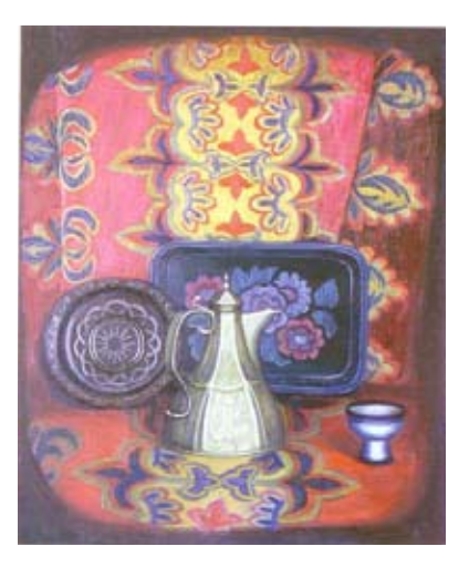
Fig. 11, 12 «Still life with a jug», 1988 and «Still life with a kettle», 1993 by A.Z. Asachakova

«Still life with an old pitcher» (1978), «Still life with ayran» (1980), «Still life with a jug» (1988), «Still life with a kettle» (1993) and others.