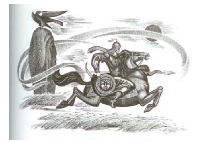
Fig. 5 «Khakass myths and legends», 1994 by R.I. Subrakov

The main feature of graphic works is that the line, which is the principal artistic technique, contributes to actualizing the national identity of the character that belongs to the Turkic ethnic group. For this reason, a warrior is endowed with description of a national hero who fought for the sake of his people. So the warrior embodies the national spirit of the ethos. As an ideal