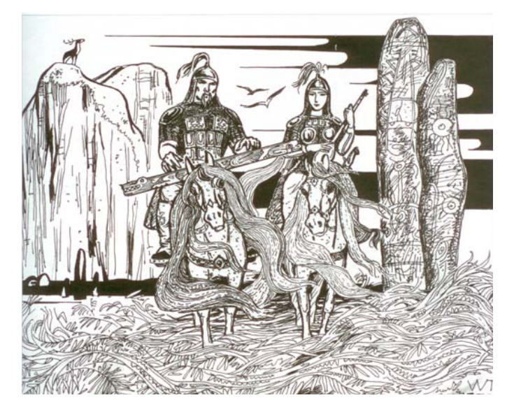
Fig. 6 «Oh Chibek Aryg», 1994 by V.A. Todykov

representative of the ethnic group, he has the courage and bravery defending his people from foreign influence. This idea can be correlated with the current state of the Khakass people that is under the pressure of Russian culture. The works depicting the fight scene of Khakass heroes are intended to influence the viewer, each representative of Khakass ethnic group. The objective of each of these works is to increase the hope and faith in the ability of self-preservation of the national and ethnic values.