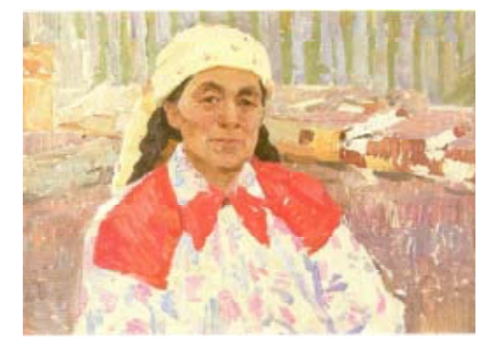
Fig. 8, 9 «The picture of shepherd», 1975 and «The picture of Khakass» by M.A. Burnakov