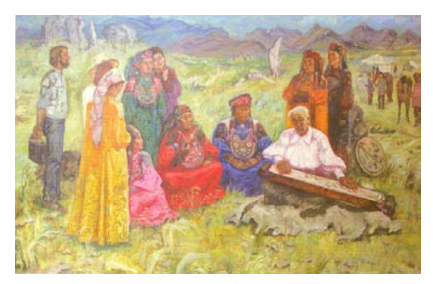
Fig. 10 «The song of Khakassia», 1987 by N.Y. Kobyltsova

person. It is the representative of Khakass ethnic group who is so important. Therefore, the external distinctive features of the character are emphasized. Among these, there are the narrow shape of the eyes, the epicanthus, black hair, prominent cheekbones, diamond / oval shape of the face. In addition, there are some attributes that indicate the belonging to the Khakass ethnos. A Khakass woman is always painted wearing the national dress and a headdress, as a rule, it is a patterned kerchief tied around her head. Khakass man is usually depicted either with a horse whose cult took an important place in the religious ideas of cattle-breeders, or playing chathane. It is the most common national instrument without which it is impossible to do «hay», so, without it the most important and leading genre of Khakass folklore, so-called «alyptyh nymaha», would not exist. The art space where the character is represented has a great importance for his identification. In most cases, there is the background of rocky landscape and megalithic architecture, or menhirs. Representation of one character or a group of characters in the natural artistic space and the image of some ancient religious monuments emphasize the complicity