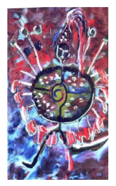
Fig. 7 «The shaman's tambourine», 1990 by A.V. Domozhakov

The spirits can be represented as zoomorphic and anthropomorphic. They are presented in the form of animals, birds, insects, snakes, vortex, fog, etc. It is an army that is invisible for humans, but it is the basis of shamanic power, the activities