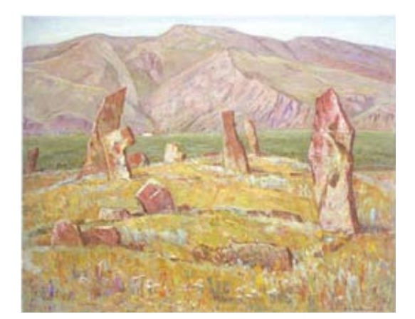
Fig. 1 «The steppes of Askis», 1994 by V.M. Novoselov