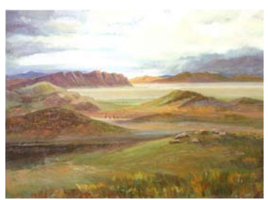
Fig. 2 «Tepsey», 2002 by G.N. Sagalakov

is megalithic architecture which is the main character of pictorial canvases by Khakass artists. For example, there are works by V.F. Kapelko «Uybatsky Chaa-tas» (1983), V.M. Novoselov «The steppe of Askiz» (1994), G.N. Sagalakov «Tepsey» (2002) and F.E. Pronskikh «Tashtyp» (2001).