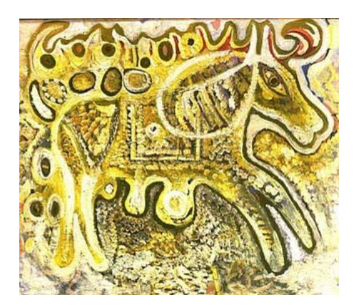
Fig. 4 «A horse-deer», 1990 by A.V. Domozhakov

The plots borrowed from Khakass heroic legends and also a direct appeal of the artists to the national religion – shamanism is of great importance for the expression of the religious and mythological world outlook of the Khakass.