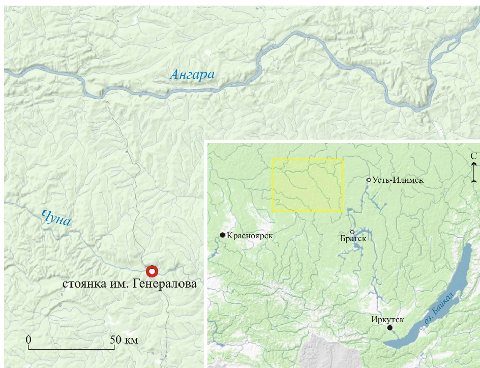
Fig. 1. Map showing the location of the archaeological site named after Generalov

At the heart of this study is an analysis of the collection of Posolskaya pottery obtained from excavations at multilayer archeological site named after Generalov (Fig. 1). The archeological site was open in 2009 by a detachment of the Irkutsk State University (S. Kogay) as part of the archaeological survey along the route of