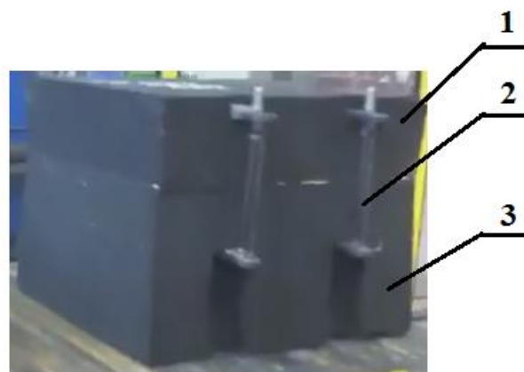
Fig. 2. Complete mold, form made on \alpha -set to process: 1 – Top half-mold; 2 – Mechanical fastening of half-molds; 3 – Bottom half-mold

For this reason, it was decided to test the composition of the mixture for the automatic line using as a fresh sand of the regenerate used for the filling mixture in machine molding. A positive result was obtained when using the composition given in table № 3 (variant № 2), which is acceptable for the stable operation of the molding line.