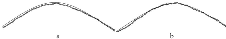
Figure 1. Improving the accuracy of the probability density function estimation.

In Figure 1, let us represent a numerical example. The solid line is exact probability density function f(x) , a – kernel estimator of the probability density function, b – correction of the kernel estimator function by Richardson's extrapolation.