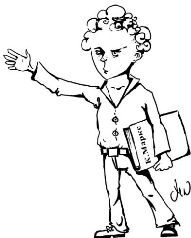
Fig. 2. «Vovochka ideological». A unique case: the character of V.I. Lenin (Ulyanov) split in the mind of the audience into two independent mythological images – little Volodya Ulyanov and the “Grandpa Lenin”