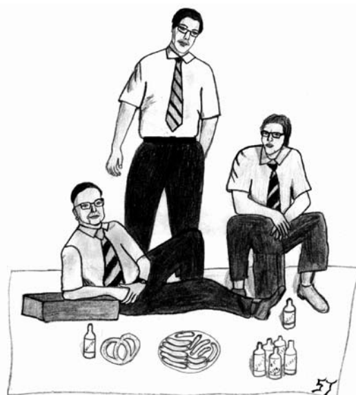
Fig. 5. «Germans». Together with the Finnish and French people they are most understood and favorite nations to the young Russian socio-humanitarian intelligent people (the research took place in St. Petersburg – bordering with Finland city)