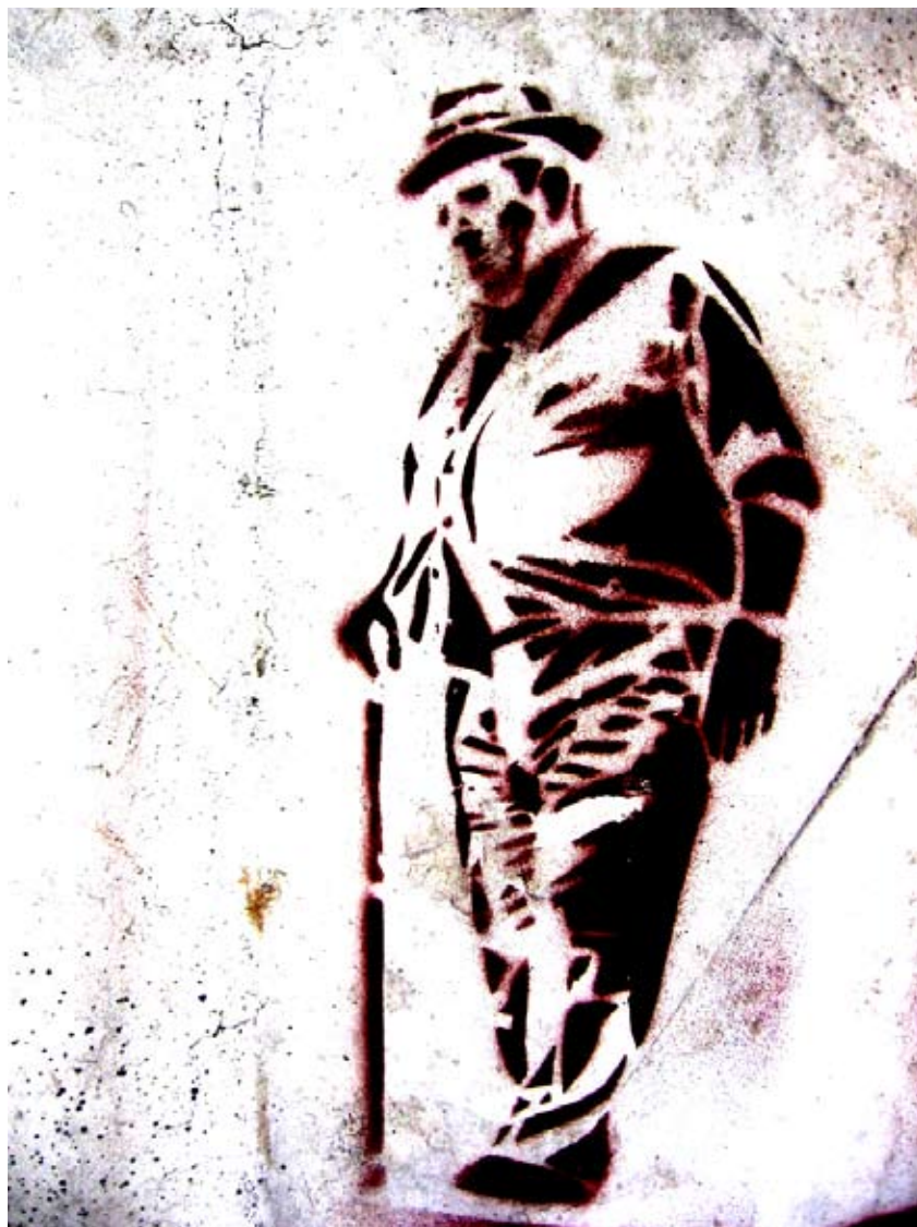
Fig. 1. «Uncle Ben». The city wall stencil designed in stenciling style. St. Petersburg historical city center, 2007