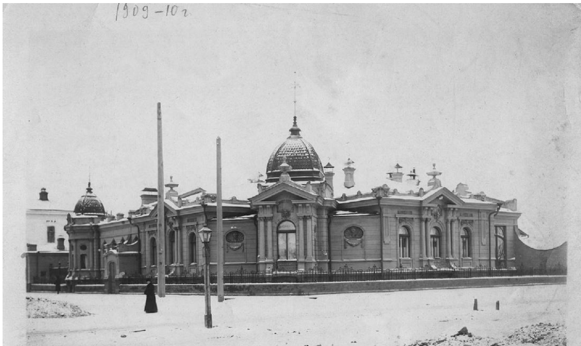
Figure 1. Sokolovskiy V.A. The Mansion of P.I. Gadalov. The view from the intersection of Karl Marx Str. and Parizhskoy Kommuny Str. Russia, Krasnoyarsk. 1909

The street facade of the building is decorated with rustication and has a great number of decorative elements. It can be divided into three parts: the entrance, the main part and the winter garden.