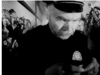
5. Visiting prisoners behind bars