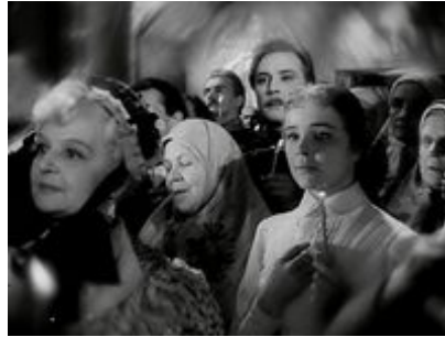
4. At the morning service