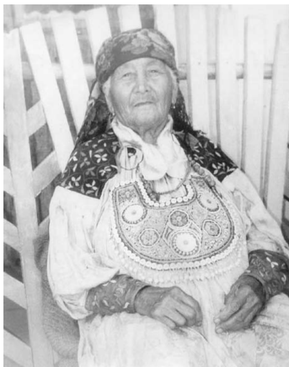
Fig. 1. A photograph of a Khakass woman from Ust-Kinderla village wearing pogo pectoral

sometimes with a dot in the middle. The dot considered to be the soul of the Sun. Deciphering the symbols this is especially interesting for the present research if we recall the participation of women wearing pogo in the ritual of worshipping the Sun and the Moon. We can see the circles with dots in the centres on the stone monuments of Khakass-Minusinsk Hollow. Analysing the symbols found on the stone monuments, the researchers of these archaeological monuments suppose that identification of the Progenitress Woman with the Sun surrounded with some separate stars and constellations of stars was typical for the ancient Khakass cultures. The constellations of stars were depicted as concentric circles on the side edges of the monuments. So, the semantics of the wedding Khakass pectorals is quite complicated, it originates from the ancient solar cults, the earth cult and at the same time performs the amulet function. All these functions