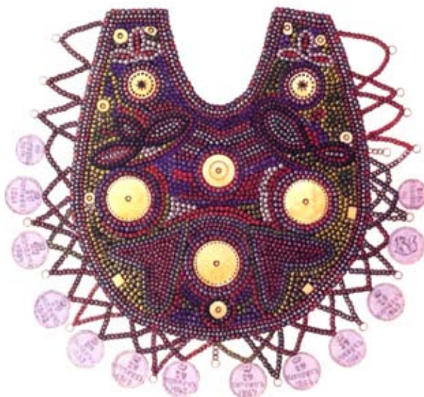
Fig. 2. Pogo from the collection of Minusinsk Museum of Regional Studies

that can be interpreted as a pogo pectoral. The suggestion about the cosmic “pregnancy” of Khurtuyakh Tas can be proved by the image of the world “embryo” on her belly, and this drawing consists of three parts. The upper part of the drawing is the image of the Upper World, Ooryu Chayan. It is the World of Creators, or Chayans. A human lives there as a hoot , or a “red embryo”, in a lake of milk. Following the Great Rivers of hoot life, the human goes down to the Middle World, Kunni Cheer, the World of the Sun, where the human lives from the childhood till anility. Here the human must live in love and harmony with himself and with the surrounding world. This world is populated with powerful spirits, and the life in this world is very short. For this reason, there is no space for evil in this world, the mission of the human is to live in Love, Harmony and Creation. Coming to this world, the human must know that everything that has been created before was created by the Gods. Only in this world the human has the happiness to give birth to a child and to bring him up. The lower drawing on Ulug Khurtuyakh Tas’ belly is the image of the Underworld called Syn Cheer