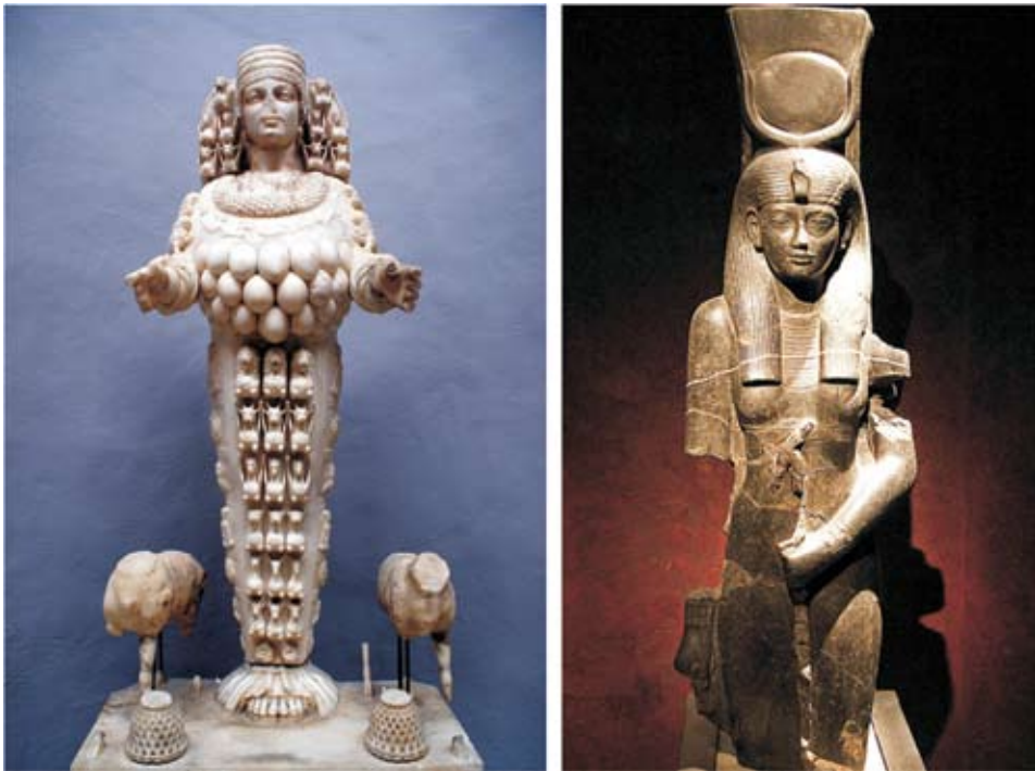
Fig. 4. From left to right: Multibreasted Artemis (Diana) of Ephesus, b) an image of Isis, 14 century BC. Egyptian Museum in Turin