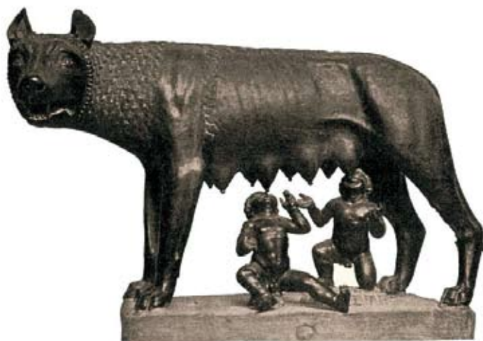
Fig. 5. Capitoline Wolf. Beginning of the 5 th century BC

The shining of beads and pearls, silver and gold is supposed to draw the attention of the gods to the woman's breasts while she is performing rituals and ceremonies, for them to fill the breasts with milk, the drink of life and the magical gift that grant prosperity to the family, provides the spiritual bond between the mother and her child. It's no coincidence that the word "umay", besides the name of the goddess, has a meaning "umbilical cord", the connection channel between the mother and the child. The sacrament of breast-feeding is performed wearing the pogo, and it is magically fixed in the ornament language. So, we speak of some sort of an induction ritual, where pogo symbolizes a sign of a woman introduced into the sacrament of maternity. Khakass women had other ways to line out the borders of different social statuses of women, like, for example, wearing many braids before marriage and two braids after marriage. Preserving the institution of marriage should be regarded as one of the leading ethnocultural traditions.