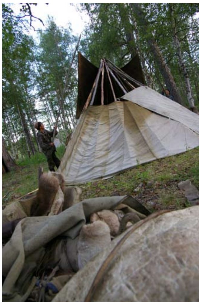
P. Dugin. The installation of chum in the reindeer team №5.

example, the researcher Wsevold Isajiw (Isajiw, 1994:76-177) made a list of the distinctive features of ethnic groups that were mentioned in 27 definitions. He summarized them in 12 distinctive features. The first five which were the most common included (in decreasing order) the following features: the common origin of the ancestors, the same culture or customs, religion, racial or physical characteristics and language. The presence or absence of these characteristics can be easily examined or noticed. Most of the remaining features include characteristics based on feelings and perceptions of the status, for example, a sense