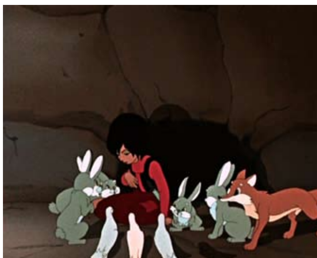
Fig. 4. A frame from "The Snow Queen" cartoon, 1957

all the possibilities of the tale, the wide meaning of the word are fully reflected. Regarding the importance of a fairy tale the Snow Queen notes, "A fairy tale is not a newspaper. Once you get into it, then it's for centuries"; "H.C. Andersen made me immortal". She also makes irony about Kai's words "well, we are grownups already, aren't we? We understand that the Snow Queen does not exist": "Of course, she doesn't! The Snow Queen