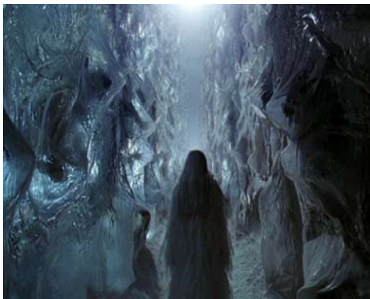
Fig. 8. A frame from "The Snow Queen" film, 2002

of which (interpreted by the Christian mythology) were more likely the basis for H.C. Andersen's tale.