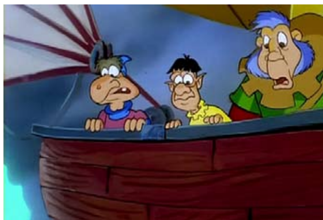
Fig. 6. A frame from "The Snow Queen" cartoon, 1995. Trolls

Other characters of the original tale are also changed: the robbers are represented by rats, the