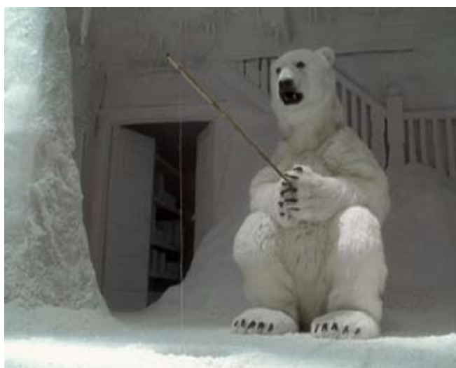
Fig. 9. A frame from "The Snow Queen" film, 2002

Kai does not like it at the Palace of the Snow Queen, which contradicts the tale of H.C. Andersen, where Kai thought the Palace to be the best place on earth. In the film Kai feels too cold at the Palace, he feels like a prisoner. Here