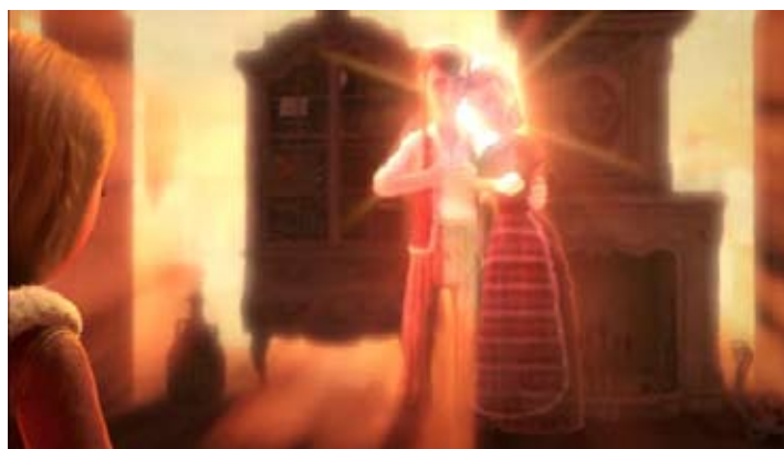
Fig. 14. A frame from "The Snow Queen" cartoon, 2012

the Snow Queen ("You thought you had taken away my family, but you were wrong, they will always be with me, no one can take them from my heart. Do you hear me? No one!") reminds us of Harry's words addressed to the dark Lord at the end of the film "Harry Potter and the Order of the Phoenix" ("You are so weak, you will never know neither love, nor friendship. I feel sorry for you"), and his dialogue with the ghosts of his parents and friends (Lily Potter: "We have not gone nowhere", Sirius Black: "We are here, in your heart") (Fig. 14).