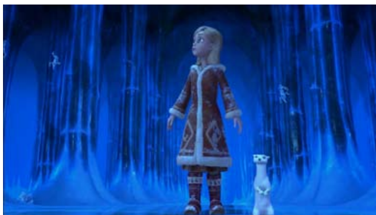
Fig. 13. A frame from "The Snow Queen" cartoon, 2012