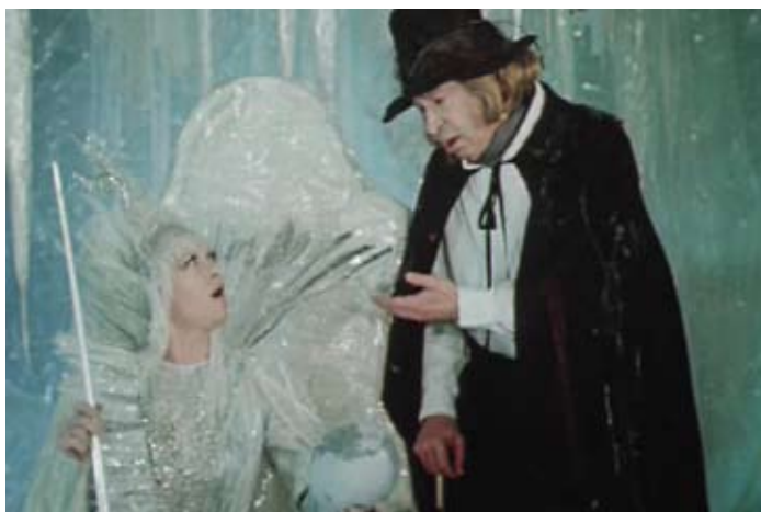
Fig. 5. A frame from "The Secret of the Snow Queen" film, 1985. The Snow Queen and the Voice of the Fairy Tale

actions (Fig. 5). Thus, it is free to deliver its opinion regarding the characters of the fairy tale and is not just an independent storyteller. For example, it says to the face of the Snow Queen: "I am strongly against you". Its words are of a significant power, for example, if it says that spring has come, in the middle of winter snow begins to melt and spring really comes, surprising both autumn and the Snow Queen. But possessing such power, the Voice of the Fairy Tale is not always careful with words, and it results in bad consequences. Thus, it forgets to say "once there lived a baron" and the baron immediately gets into trouble: he loses his power, his wife leaves him saying: "When this fairy tale was created they forgot to say about you "there lived a baron". Therefore, you are an empty spot. And what for to be near an empty spot?" This moment is always reminded of to the Voice by the robber girl and the Snow Queen. The Snow Queen not only blames the Voice of the Fairy Tale, but tries to use its mistake for her benefit: "If only one link of the fairy tale is lost, the whole story will go another way... We can use it". Moreover, the Snow Queen invented another way to influence the word, the Voice of the Fairy Tale: "I will make you catch cold, the Voice of the Fairy Tale will not only become hoarse, but