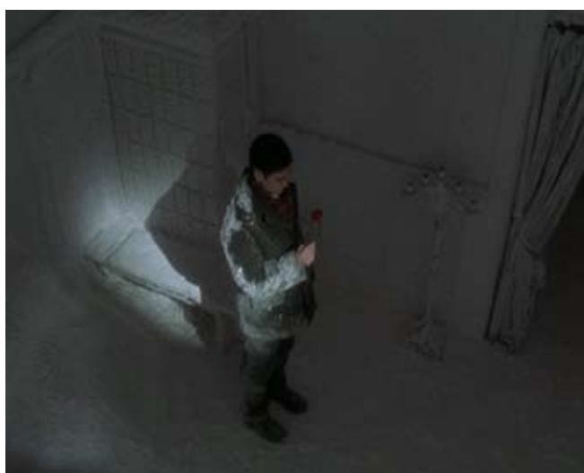
Fig. 10. A frame from "The Snow Queen" film, 2002