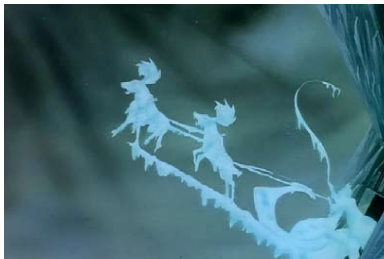
Fig. 7. A frame from “The Snow Queen” cartoon, 1995

daughter of the woman gang-leader wants Ellie to be in her service; the Laplander girl Frida teaches reindeer in the summer school (which are drawn as dogs but with horns and hoofs) and goes with Ellie to the Palace of the Snow Queen; she prepares poison to vanquish the mirror. A new character appears, the sparrow Peeps, which performs the functions of a magic friend. The woman who performs magic, changed a lot. In the 1995 cartoon it is a witch with a hooked nose, warts on her hands, without teeth, with long nails, she has a skull in her house. The witch makes the elixir of life, to finish which she needs a heart of a little girl. That is why she needs Ellie. In her speech the witch uses some words and phrases related to the historical background of the cartoon: thus, she makes research experiments using chemicals; teaching at the reindeer school is based on theory and research, for example, the flight paths are studied.