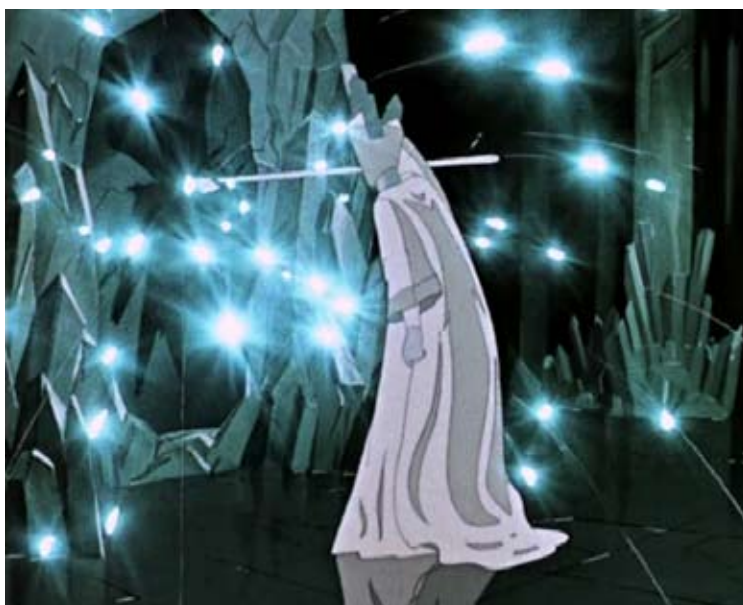
Fig. 2. A frame from “The Snow Queen” cartoon, 1957

little people” (Fig. 2). The Snow Queen didn’t only wound Kai – it was just the beginning of his change: the Snow Queen often talks to him, trying to change his mind: “You became very clever, Kai. ... I told you many times: the fragrance of flowers, the beauty and joy, the verses of poets and love – they do not exist. You have to forget all that ... Do you remember Gerda? Do not worry, you’ll forget even that”. In 1957 cartoon Gerda is represented as an opposite of the Snow Queen – she is kind, she can cultivate morality even in the robbers (Fig. 3). So, the little robber girl not only lets Gerda go and releases the reindeer from her