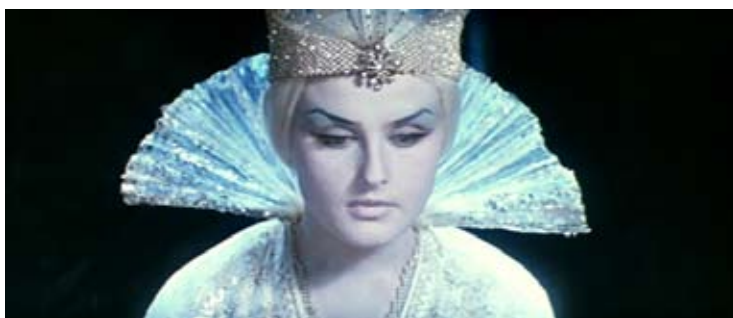
Fig. 1. A frame from “The Snow Queen” film, 1966