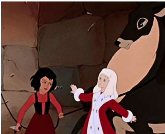
Fig. 3. A frame from "The Snow Queen" cartoon, 1957