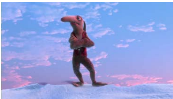
Fig. 11. A frame from "The Snow Queen" cartoon, 2012

The cartoon begins with the story about the Snow Queen reminding of the description of the north by the reindeer from E.L. Shvarts' work: "having once appeared in the North, the Snow Queen has changed the lives of all people on earth. They were hiding behind the walls of their houses from cold and fear". Nevertheless, if in Shvarts' work people escaped to the south, in the modern cartoon the focus is made on kind wizards, who tried to fight the Snow Queen, and disappeared with time. The last kind wizard was master Vegard, who created mirrors reflecting the true essence of things. The Snow Queen killed him and continued to chase his successors, while the magic mirror in her Palace told her that Vegard's successor with a strong heart will stop the powers of the north. Vegard's successor Kai is a beginning artist, and in this interpretation the Snow Queen hates all artists and kills them by turning them into ice sculptures. Kai and Gerda, both Vegard's children, after the death of their parents live in an orphanage, where they have to work like slaves (it is worth noting that the theme of slavery appears in the cartoon several times, thus the troll calls himself the Snow Queen's slave). When Gerda leaves the orphanage to find Kai, she along with the troll and the weasel (her pet) come to the