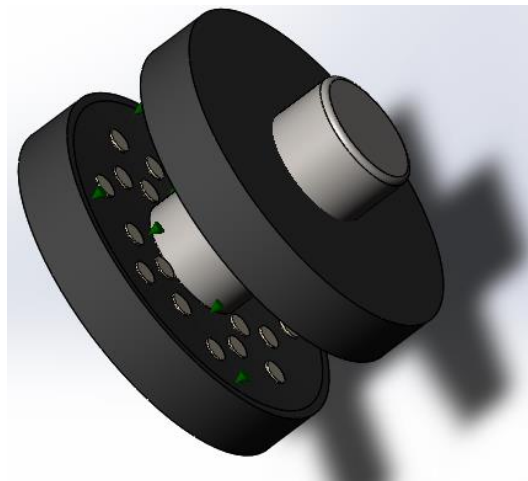
Figure 2. The distribution of forces in the developed device.

Upon receipt of axial disturbance, the forces are distributed as shown in figure 2.