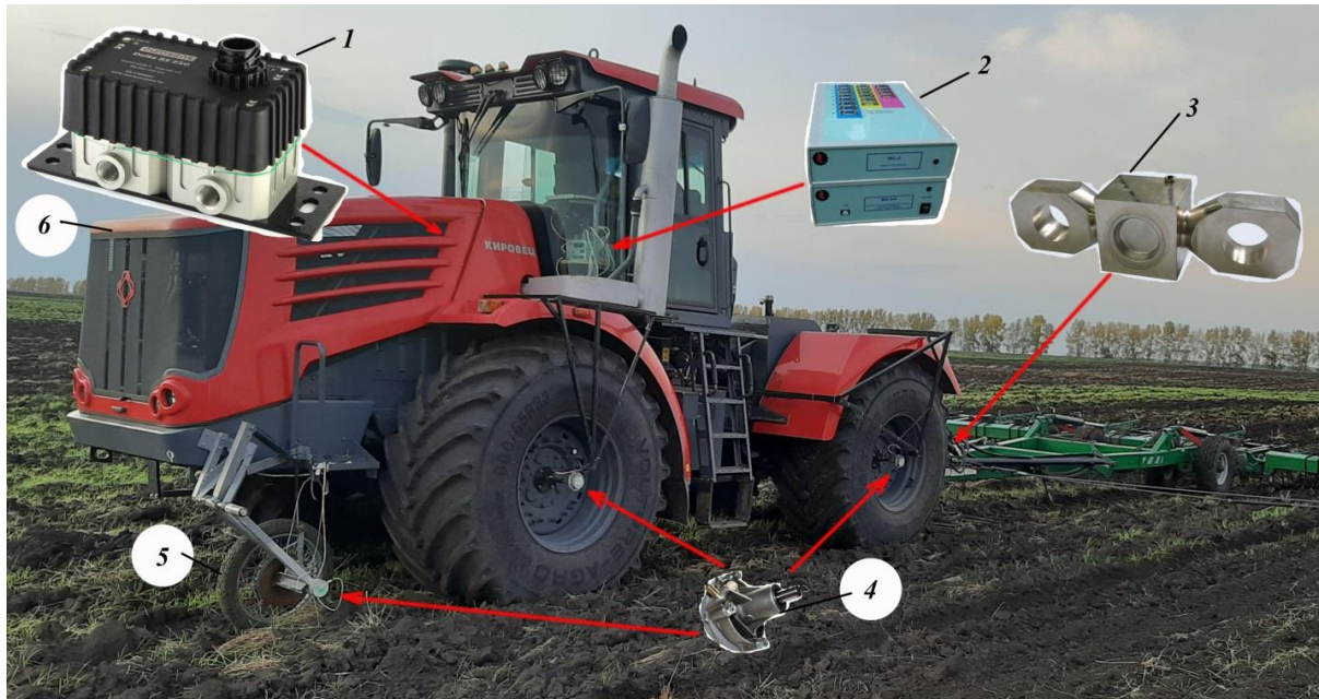
Figure 2. The location of the elements of the information technology system on the tractor: 1 - fuel flow meter; 2 - measuring information system IP-264; 3 - strain gauge sensor; 4 - speed sensor; 5 - a measure of the distance covered; 6 - tractor K-744R2.

To implement the experimental research system, the general methodology of laboratory-field and operational and technological tests using the information and technical system for recording impact factors and tractor adapter parameters has been substantiated.