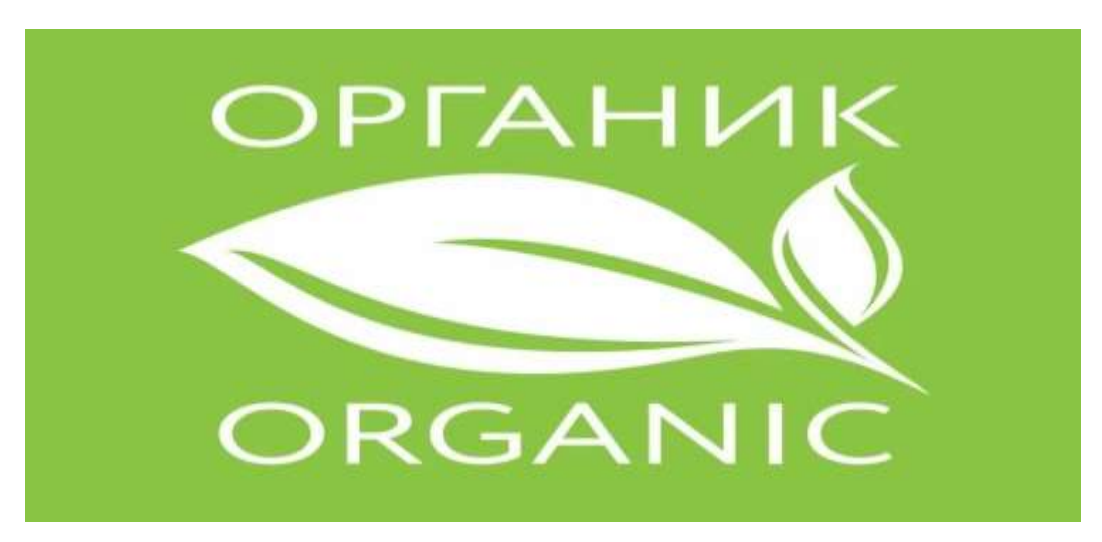
Figure 1. Russian organic products mark.

It should be noted that in turn, the territorial brand, as well as its geographical location, which determines the natural and climatic conditions, have an impact on the success of product brands. For agricultural products, like no other, the most important factor in the price-quality ratio for ensuring competitiveness is the territory of production.