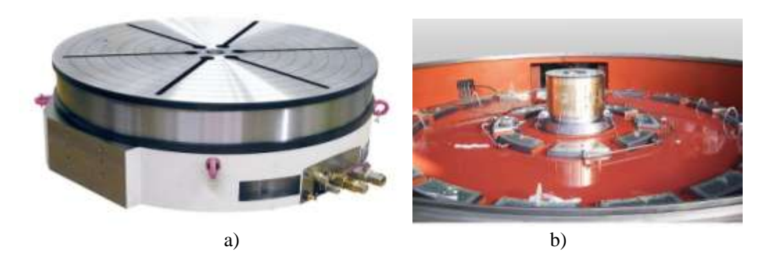
Figure 4. ZOLLERN Hydrostatic Turntable on Hydrostatic Bearings

Hydrostatic supports in precision measuring equipment. ZOLLERN produces rotary tables (Figure 4, a) on hydrostatic bearings (Figure 4, b) up to 550 mm<sup>11</sup> in diameter for measuring machines that measure deviations in the geometric parameters of large parts. The 1000 mm diameter turntable is capable of receiving an axial load of up to 120 kN and providing an axial run-out of less than 1 \mu m.