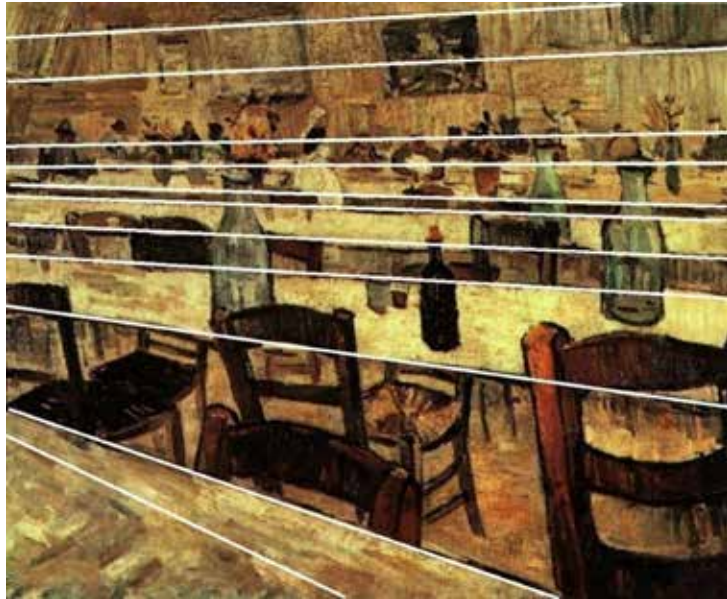
Fig. 7. Interior of a Restaurant in Arles, Vincent van Gogh (August 1888)