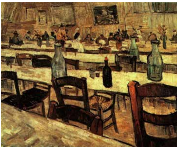
Fig. 6. Interior of a Restaurant in Arles, Vincent van Gogh (August 1888) Oil, canvas; 54*64 cm

The diagonal lines of another direction (Fig. 8) are formed by two groups of charac-