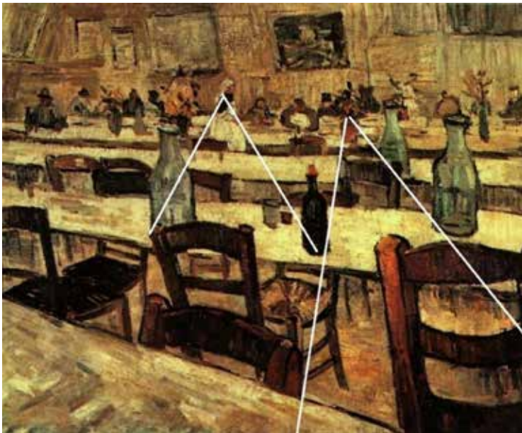
Fig. 8. Interior of a Restaurant in Arles, Vincent van Gogh (August 1888)

ters: 1) the vases standing on the remote tables, with the vase being the vanishing point; 2) the wine and water bottles and the walking woman. These triangles of the perspective lines guide the viewer's look and get him optically involved in the composition. These compo-