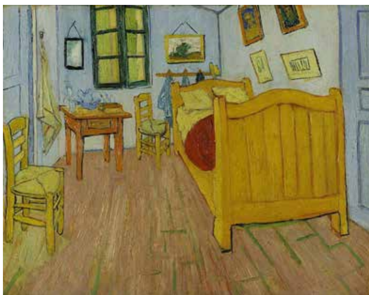
Fig. 1. Bedroom in Arles, Vincent van Gogh (1888) Canvas, oil, 72*90 cm

purpose of this analysis is to identify the specificity of the architectural space in the works of the artist.