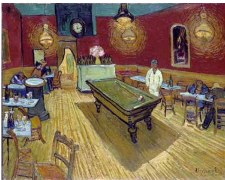
Fig. 4. Night Café, Vincent van Gogh (September 1888)