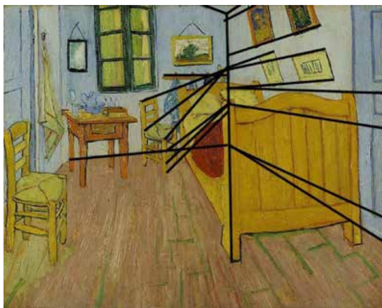
Fig. 2. Bedroom in Arles, Vincent van Gogh (1888)

Another important part of the general composition is the focus of the viewer's attention on the head of the bed achieved by several means; first of all, this is the vanishing point of many lines, and the line of the clearly drawn corner stretches to the bed leg edge, bringing out the composition axis, and dividing the illusive space of the painting into two parts almost through the centre of the canvas. It can be said that the entire space is built around this axis (Fig. 2). The focus of attention on the head of the bed is especially important, because this is the thinking centre (over the head of the bed,