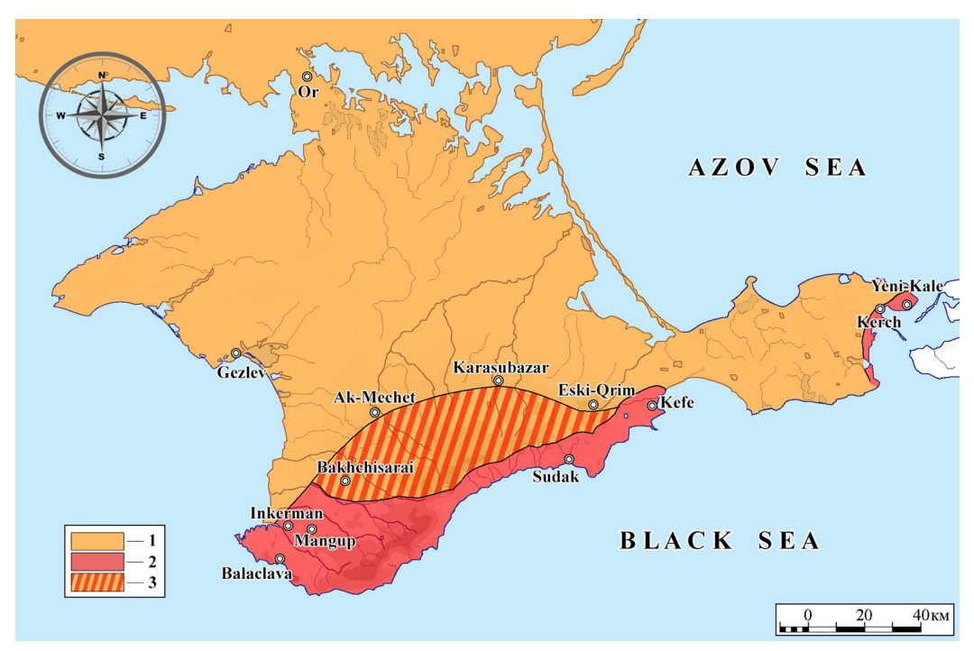
Fig. 2. Political map of the Crimean Peninsula with the location of the cities, 1475–1774. 1 – the Crimean khanate, 2 – the Ottoman Empire, 3 – the territories of the Crimean khanate inhabited by the Christian population

Crimean khanate did not have a developed system of urban centres. By the time of its emergence in the middle of the 15th century. the Crimean khanate had only two cities on the peninsula which were founded in the previous Golden Horde period – Solkhat (Staryi Krym / Old Crimea) (Kramarovskii, 1989: 141-157) and Kirk-Eir (Chufut-Kale) (Fig. 1) (Gertsen, Mogarichev, 1993: 39-58). During the three centuries of the Ottoman presence in the Crimea, the number of the subdued cities hardly changed (Veinstein, 1986, 221). In the 18th century, the seventh city – Yeni-Kale (Fig. 2) – was added to the previous six ones. It grew out of the suburb of a new Turkish fortress built to protect the Kerch Strait from the penetration of ships of the Russian Empire (Bocharov, 2015: 5).