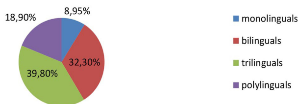
Fig. 2. Language proficiency (%)

According to the chart (Fig. 2), there is a big majority of students as the respondents who know three languages. First of all, three target languages’ proficiency that is Kazakh, Russian and English implies the working trilingual policy. There are good reasons to include the share of respondents who know four and more languages in the same group since there are target languages practically in any combination of languages specified above. The share