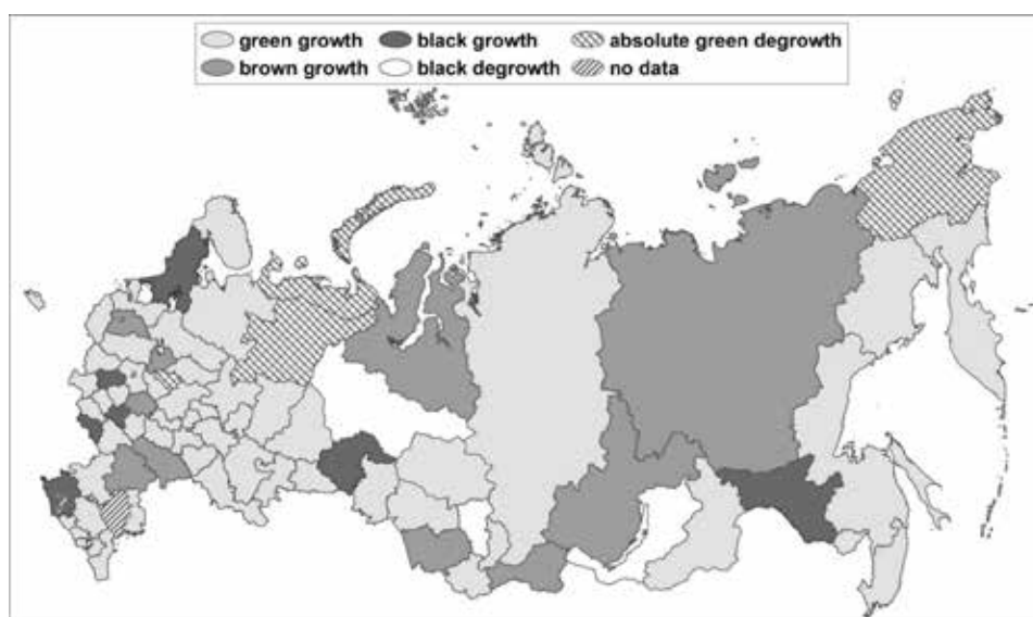
Fig. 4. Spatial distribution of the “color” of growth in the Russian regions during the 2009-2017 period by the ratio of sulphur dioxide emissions and GRP