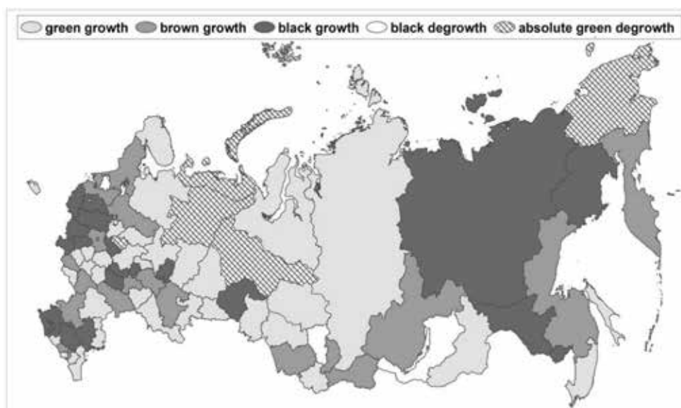
Fig. 2. Spatial distribution of the "color" of growth in the Russian regions during the 2009-2017 period by the ratio of the total emissions from stationary sources and GRP