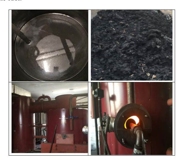
Fig. 3. WCS from the filter cake and the burning process of the fuel.

Figure 3 shows the WCS from the filter cake, the appearance of the heat generator and the burning process of the fuel.