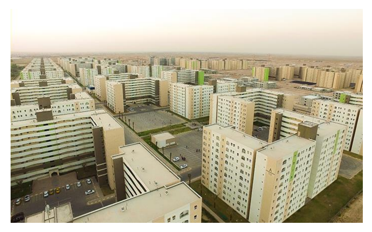
Figure 4. The city of Bismay. Iraq

The project assumes that not only 100,000 apartments will be built, but also about 300 schools, hospitals and other public institutions will be constructed. About 8,000 apartments have already been built and 5000 of them have already been inhabited. When the project is completed, the new large modern city will have 534 houses that are 59 blocks and eight districts.