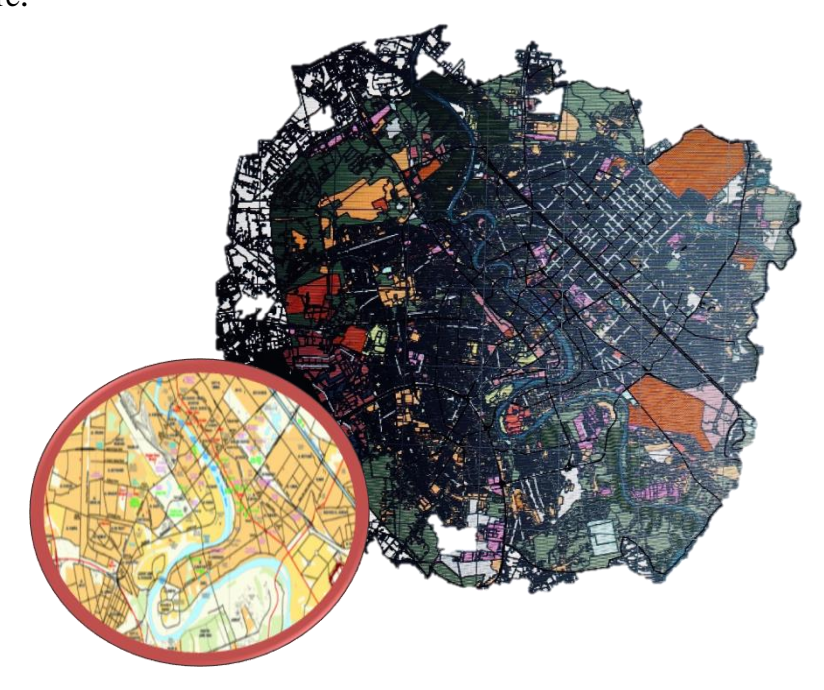
Figure 2. Map of the center of Baghdad, 2003

The analysis of the dynamics of the transformation in the urban fabric of Baghdad and Mosul has a number of historical and methodological features related to specific socio-economic, cultural, historical and landscape-urban conditions that ensure their sustainable development in the future.