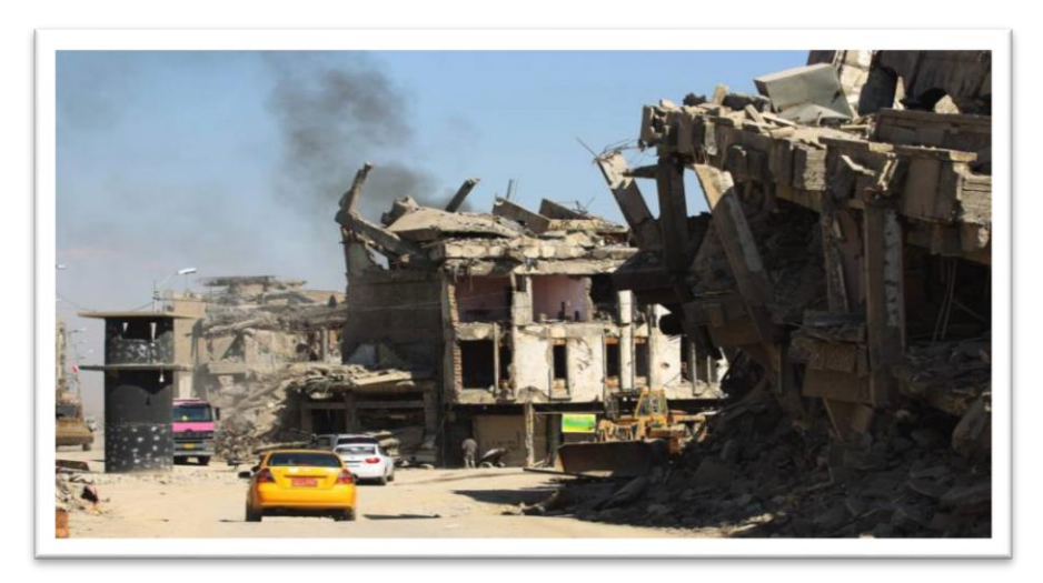
Figure 5. Ruined Mosul