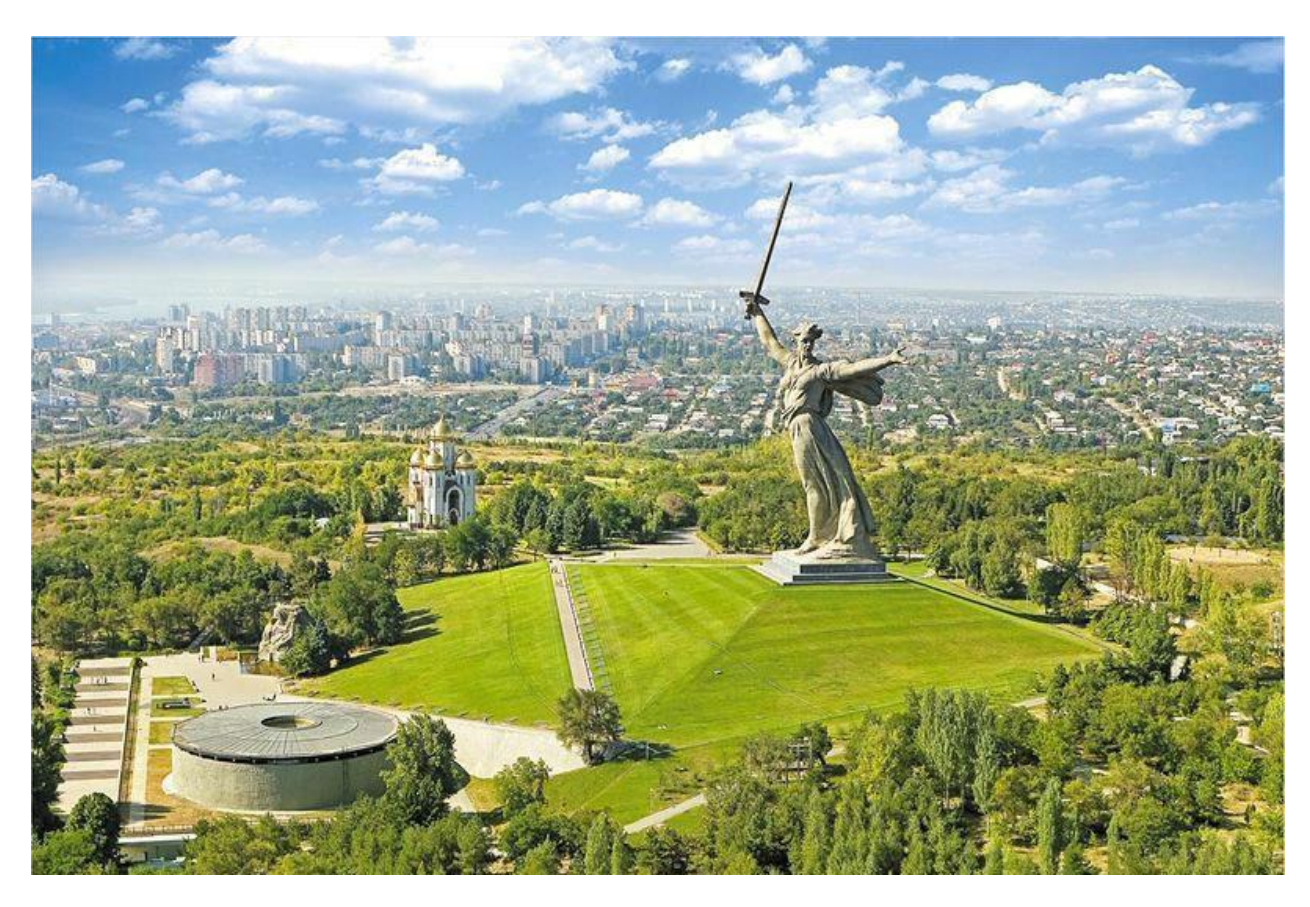
Figure 1. Modern Volgograd

The history knows a large number of cases when injured cities or cities completely destroyed by the fighting actions received a new life and a new layout. Those cities are also present in the countries of the former USSR. A striking example is Volgograd (Figure 1), whose center was bombed by the enemy during the offensive.