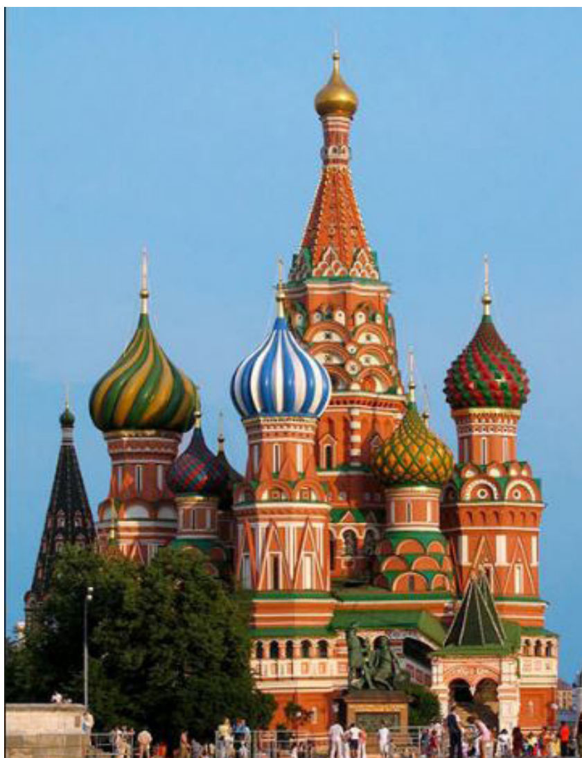
Fig. 1. The Cathedral of the Intercession on the Moat (Saint Basil's Cathedral)

allocation of the border between the two main parts of the city, in a special emphasis on the prestanding of China-town as the focus of the Posad world in front of the Kremlin, which was the seat of the tsar and the metropolitan” (Bondarenko, 1997: 35).