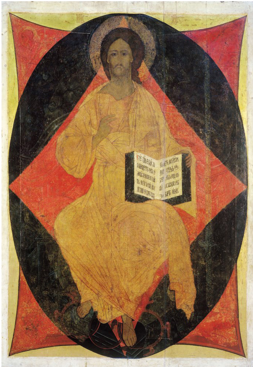
Fig. 3. The Icon of Andrei Rublev Christ in Majesty

and a formidable judge. Christ in Majesty shows the Lord Jesus Christ in the fullness of His power and glory, as the Lord of all the visible and invisible worlds, such as he appears at the end of time. The icon is directly related to the theme of the Last Judgment and the coming transformation of the universe.