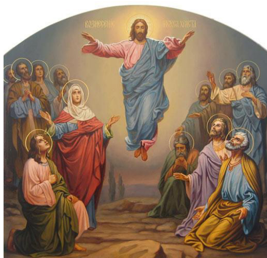
Fig. 3. Icon of the Ascension of the Lord

All the parts of the cantata Stabat Mater start with orchestral episodes that, in general, represent a separate symphony in the genre of