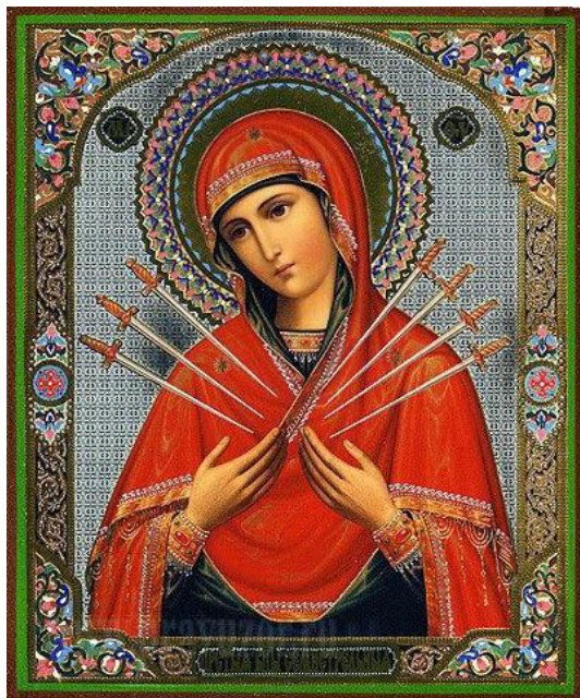
Fig. 1. The Icon of the Mother of God of Seven Blades

On the Great Saturday, instead of the Cherubic Hymn, Let All Human Flesh be Silent ... and instead of Axion Estin..., the irmos of the